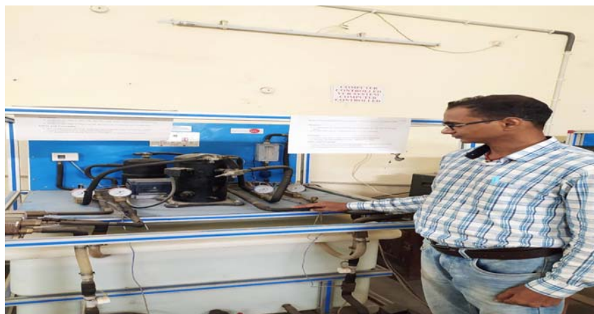
Fig 1: Actual Photographs with set up.