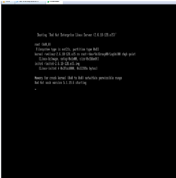
Fig 1: Simulation environment for the experimental work.