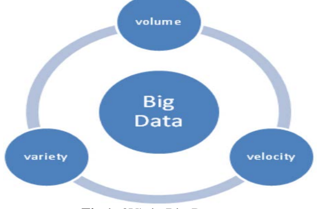
Fig.1: 3V's in Big-Data.

With regard to the definition of Big data, IBM used volume, velocity, variety, value and veracity as 5Vs to summarize the concept of Big data. More commonly, a dataset can be called Big data if it is large enough and contains valuable information at the available analysis technologies. The term big data was coined by Doug Laney in the early 2000 and his definition includes three concepts [1] that is shown in Figure.