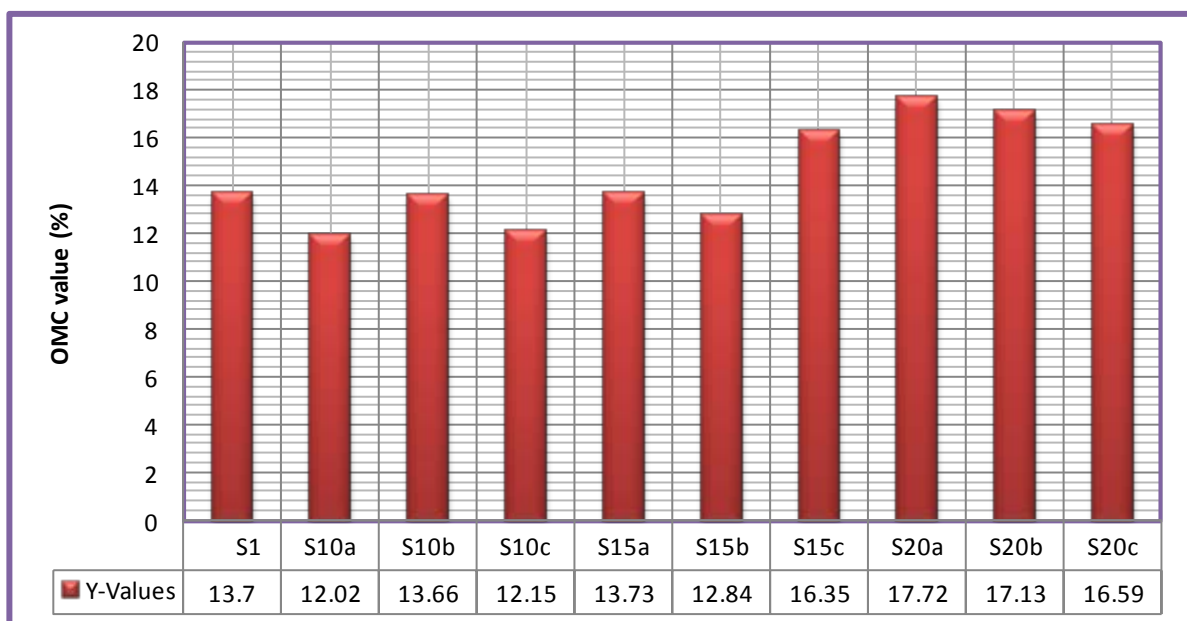
Fig 2: Variation Graph of OMC for all samples.