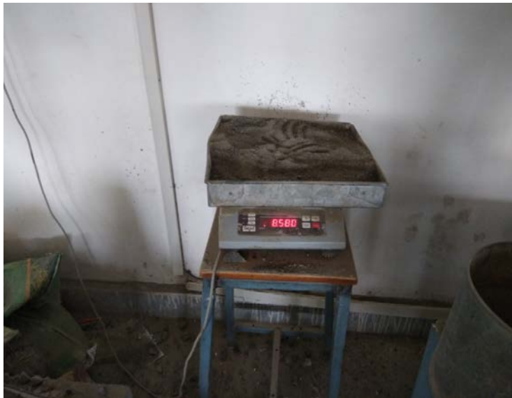
Figure 1: Ordinary Portland cement

OPC is most ordinary type of cement is generally use all over the world. It retard the faster setting time of cement. In this experimental work the OPC is used with 53 grades validate to Indian Standard IS 8112-1989 is used. OPC is environmental friendly & economical. OPC at different grade (OPC 53, OPC 43 and OPC 33) it's utilizing in general purpose in India.