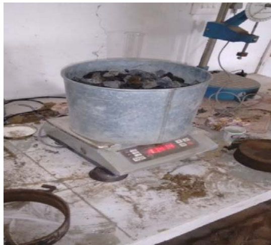
Figure 2: Coarse Aggregates

Aggregate can be classified as normal weight, light weight, heavy weight aggregate. Aggregate usually exist of natural sand and gravel, crushed rock or mixture of those materials. Natural sand and gravels are most generally used and can be acquired economically in sufficient quality. Crushed rock is widely used for coarse aggregate The state of the particles of crushing rock depends to a great extent on the kind of rock and technique for crushing. Artificial aggregates is generally used in certain localities consist mainly of crushed, air-cooled blast-furnace slag and especially burned clays. Slag is monetarily accessible just in the region of impact heaters.